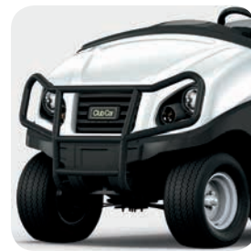
Heavy-Duty Brush Guard