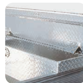
Cargo Tool Box