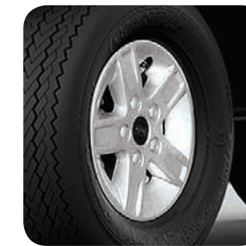
5-Spoke Wheel Cover