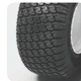
Extra-Traction Turf Tires