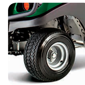
Small Wheel Package