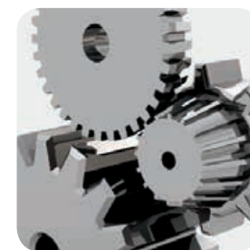
Limited Slip Differential