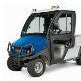
ROPS Cab (Front Hinge Door)