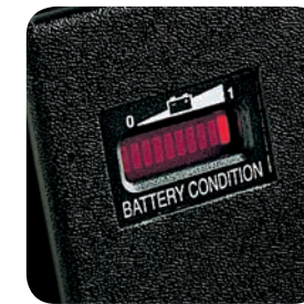
Battery Capacity Indicator