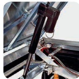
Electric Bed Lift