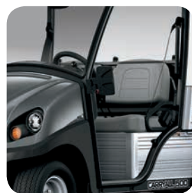
Cab Outside Mirrors