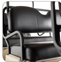
Easy-to-Clean, Durable, Marine-Grade Vinyl Seats