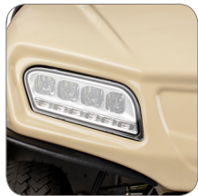
LED Headlights with Daytime Running Lamps standard

The new Villager includes safety-enhancing features such as LED headlights (with daytime running lamps), a four-wheel braking system, turn signals, tail/brake lights, and a horn to ensure that your guests arrive safely.