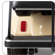
LED Tail Lights and Turn Signals standard