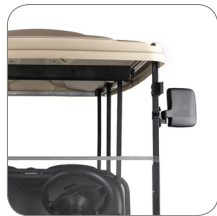
Multiple options available to enhance style and comfort